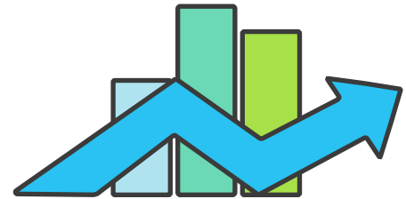
SAVING FOR FUTURE MEDICAL EXPENSES